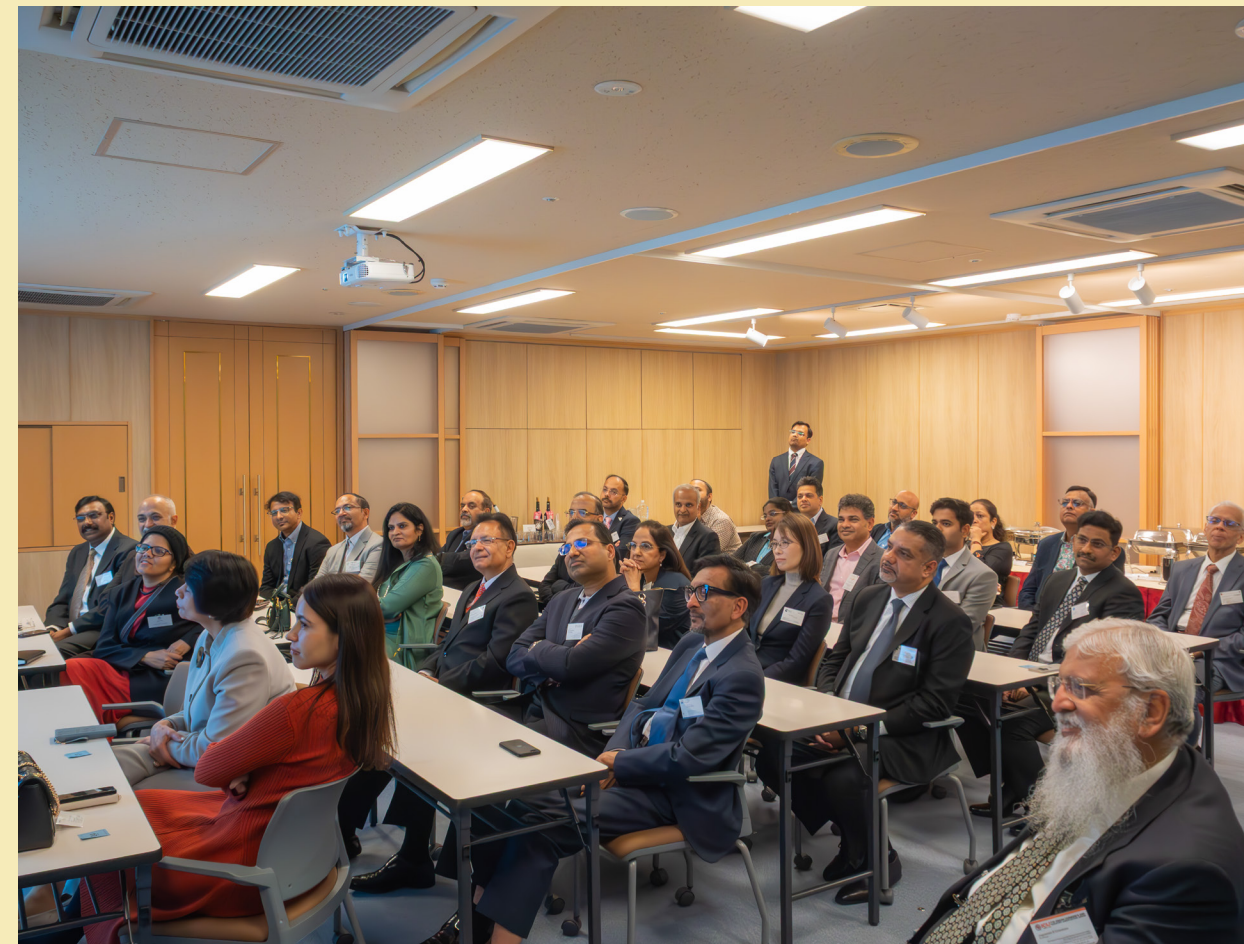
Participants at the seminar included distinguished professionals, industry leaders, and ICIJ members.